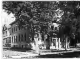
HIGH SCHOOL BUILDING, BRITT